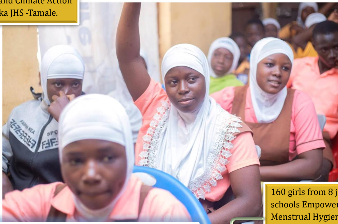
160 girls from 8 junior high schools Empowered through Menstrual Hygiene Festival.

600+ Students Trained in WASH & Climate Action