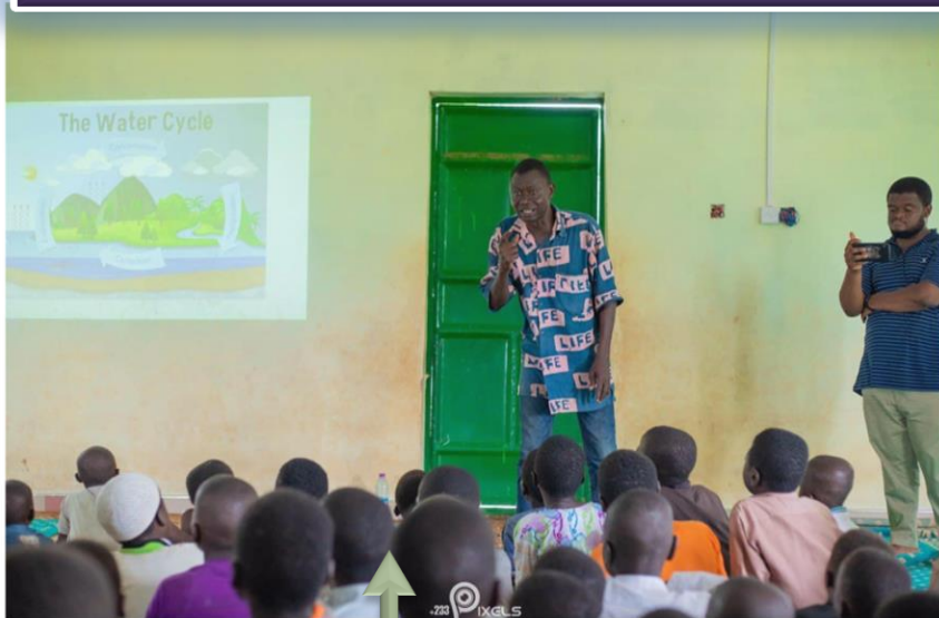
120 Students Empowered in WASH and Climate Action at Fatih Sultan Mehmet Islamic School.